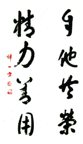
Kano's calligraphy of judo's principles